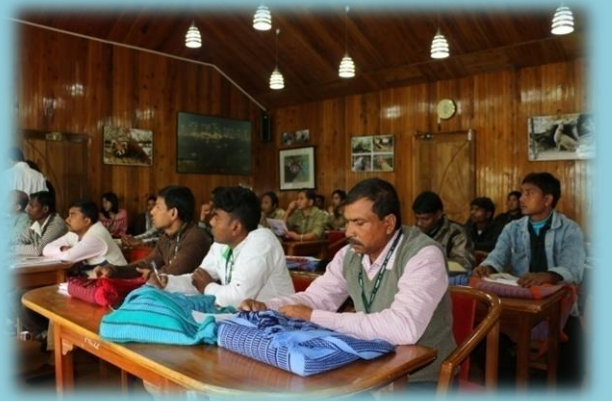
In House Discussion