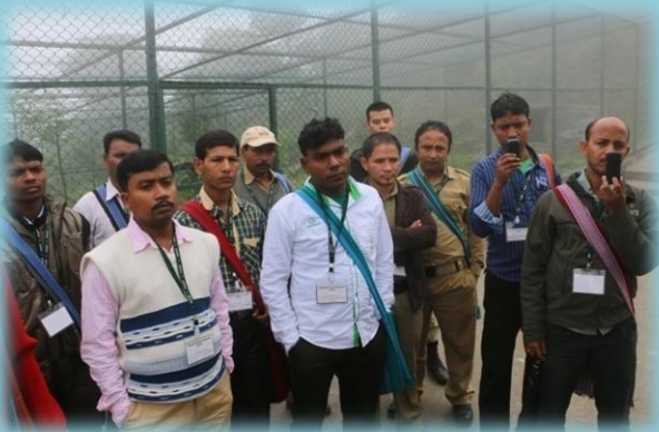
Hands On Training