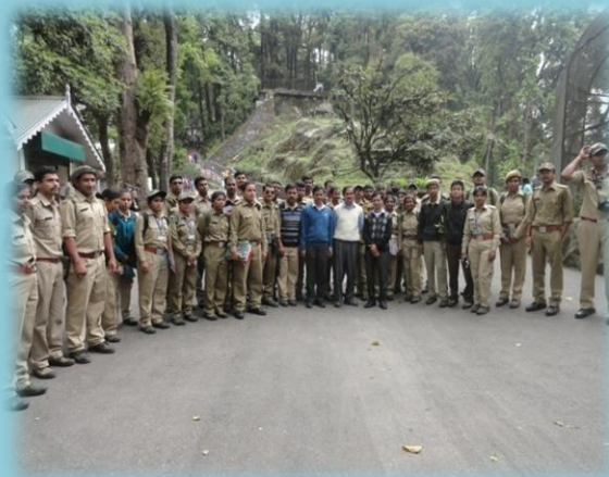
Field Visit of Uttarakhand Forestry Training Academy