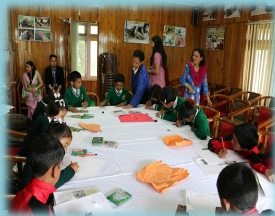
Sit and Draw Competition