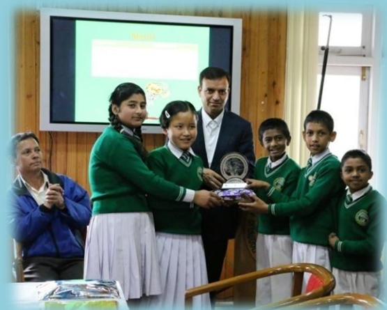
Prize Distribution by Director, PNHZ Park