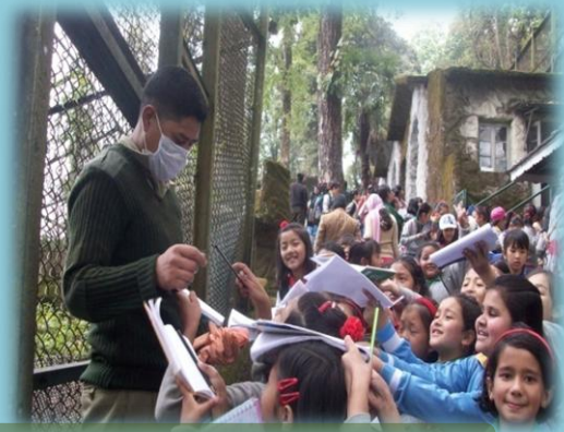
Educational Tour of Loreto Convent School, Darjeeling