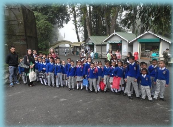
Educational Tour of St. Anthony School