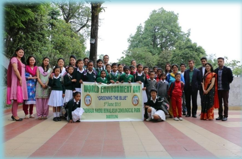
World Environment Day Celebration 2015

Swami Vivekananda Primary School was declared winner in Inter Primary School Quiz Competition.