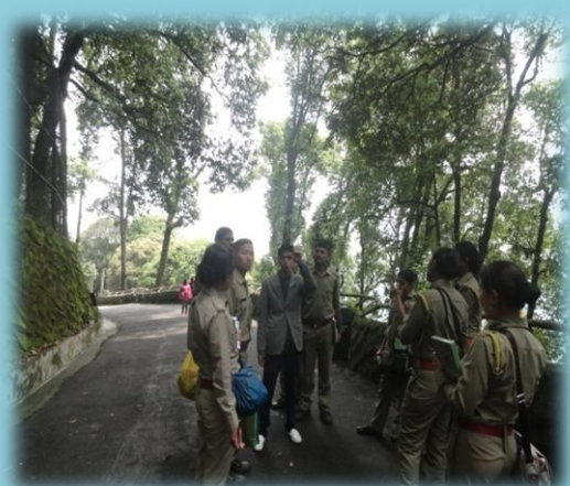
Field Visit of RFO Trainees, Central Academy of State Forest Service,