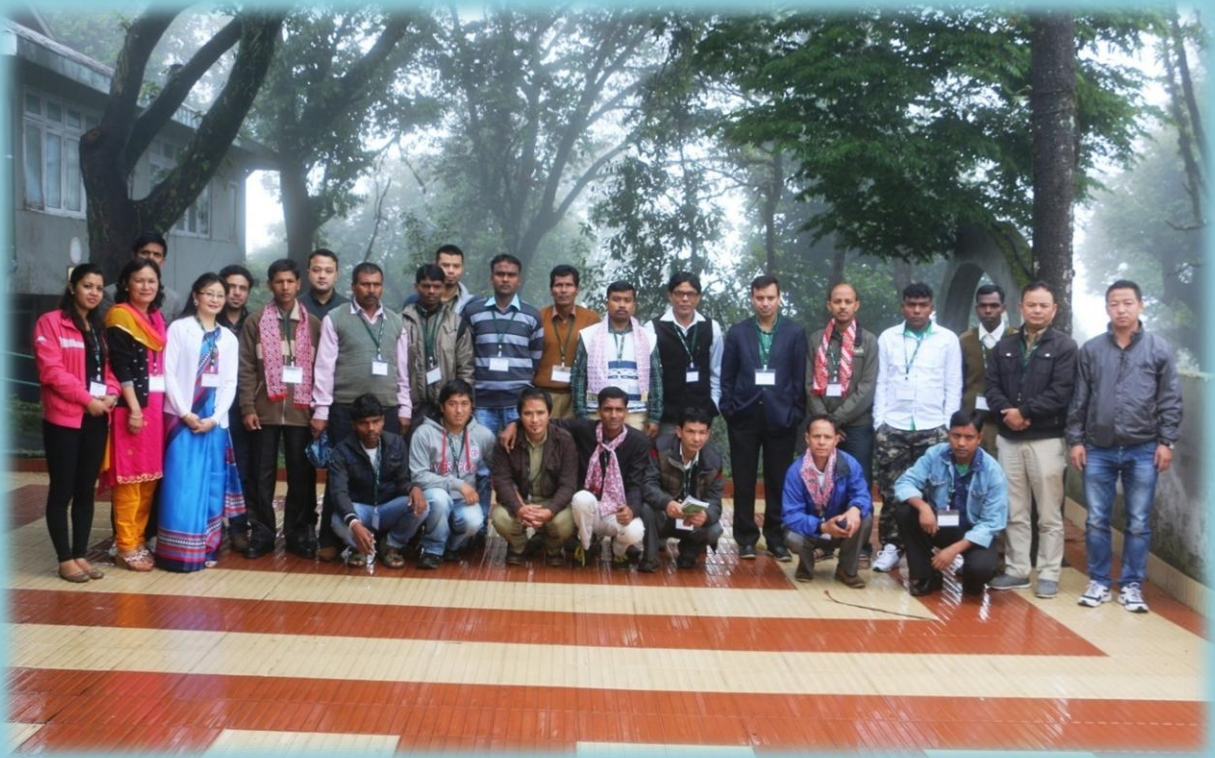
Zoo Keeper's Training Participants along with Director, PNHZ Park and Organizing Committee