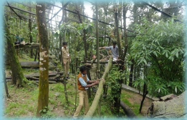
Hands On Training