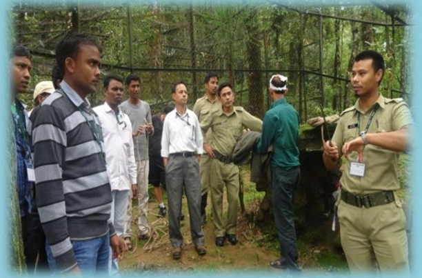
Hands On Training